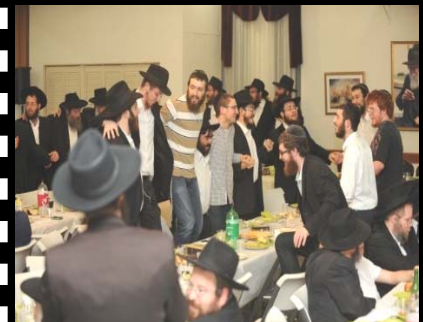
Yud Tes Kislev Farbrengen