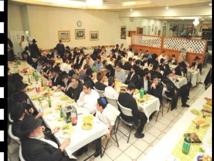
Yud Tes Kislev Farbrengen